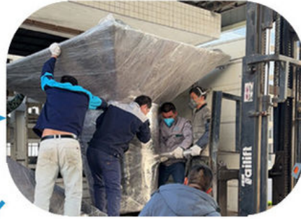
4: Packaging and Shipping