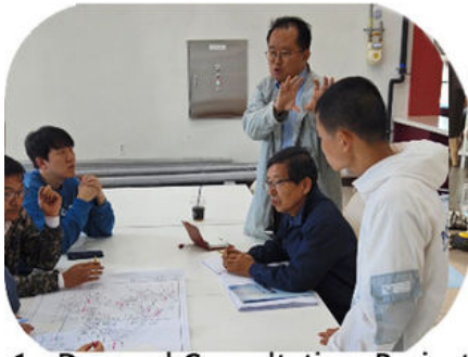
1: Demand Consultation, Project Positioning