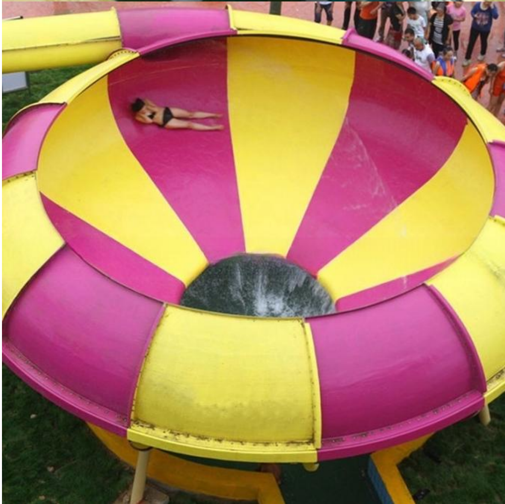
Product Exciting Fiberglass Water Park Bowl Water Slide