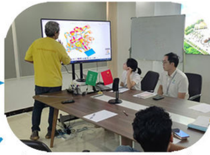
2: Solution Design-CAD Floor Plans +Construction Drawings+3DPlot