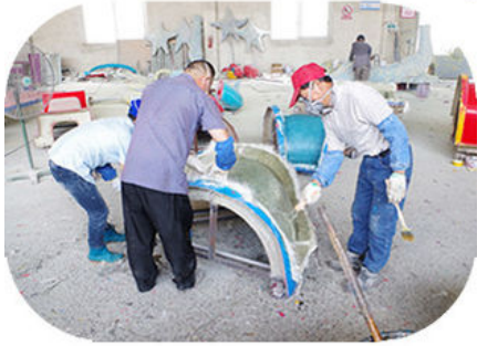
3: Factory Production