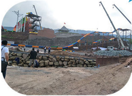
5: Engineers Guide Installation