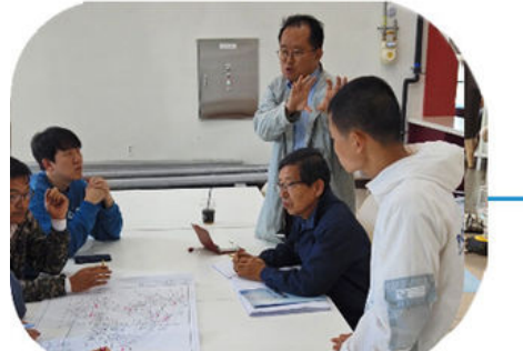
1: Demand Consultation, Project 2: Solution Design-CAL Positioning +Construction Drawing