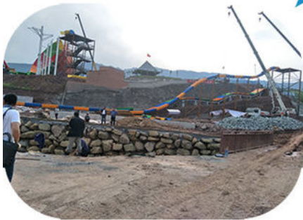
5: Engineers Guide Installation