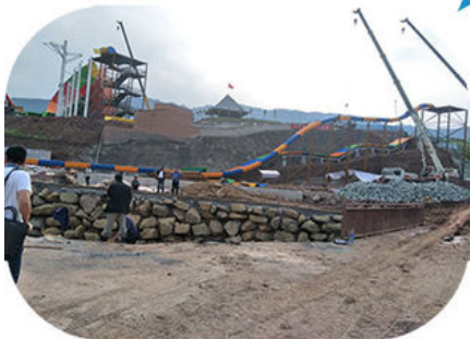
5: Engineers Guide Installation