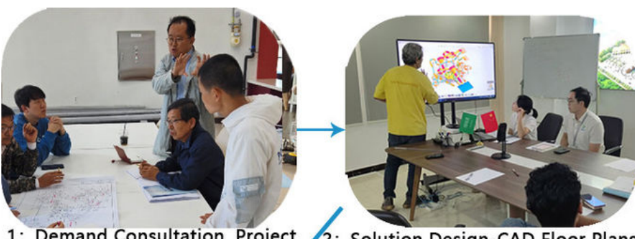
1: Demand Consultation, Project Positioning