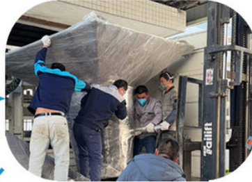
4: Packaging and Shipping