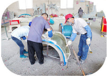
3: Factory Production